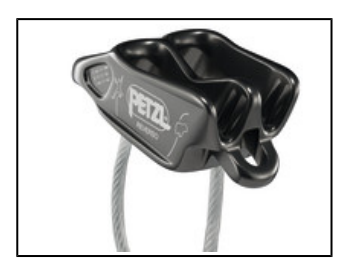
Durable and lightweight.