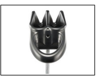
V-shaped friction grooves enable controlled braking.